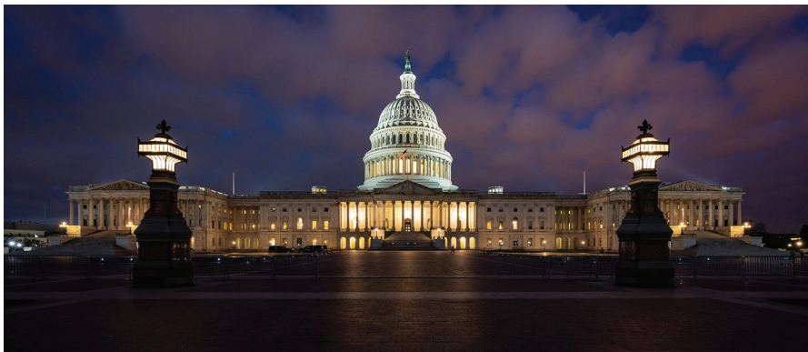
AUSA continues to push for full-year funding and inclusion of Army priorities in the National Defense Authorization Act and appropriations bills.

The timing of any formal conference between the House version of