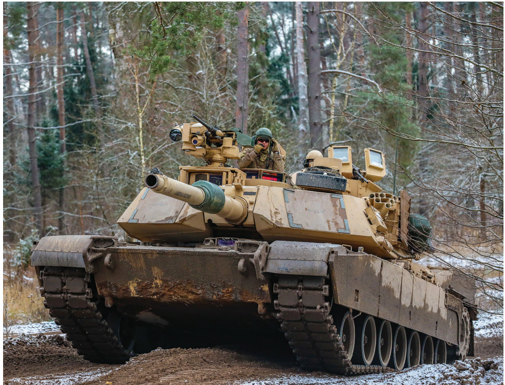
Soldiers with the 3rd Armored Brigade Combat Team, 1st Cavalry Division, operate an M1A1 Abrams tank during training Nov. 25 at Bemowo Piskie, Poland.