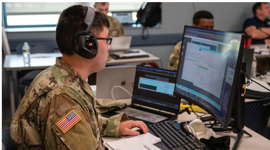
A soldier with the Connecticut National Guard searches for network intrusions during the 2022 Cyber Yankee exercise in Niantic, Connecticut.

A s global threats continue to evolve, the National Guard is investing in its cyber capabilities to fight on the digital front and keep cyber threats at bay.