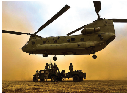
Soldiers with the 101st Airborne Division and the 1st Armored Division conduct sling load operations with a CH-47 Chinook at Petrochori Training Area, Greece.