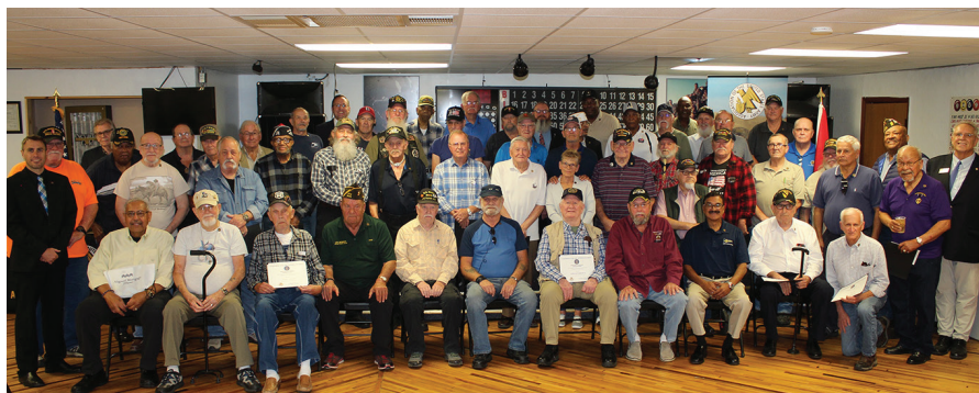
Vietnam veterans pose for a photo with their pins and certificates following a ceremony recognizing their service.