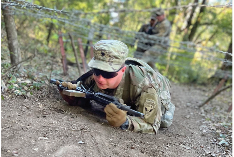
A soldier with the 11th Airborne Division low crawls in the slithering lane Nov. 24 during exercise Yudh Abhyas 22 at Auli, India.

“The CR costs us time as well as money, and money can’t buy back time, especially for lost training events,” Austin writes. “Under the CR, Congress prohibits the military from commencing new initiatives, such as those requested by our theater commanders in the Indo-Pacific and around the world or in support of