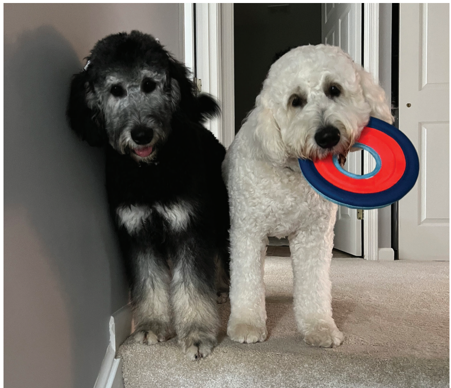
Sophie, left, and Margot are covered by Metlife pet insurance, where AUSA members receive a premium discount that can be combined with MetLife's military discount.