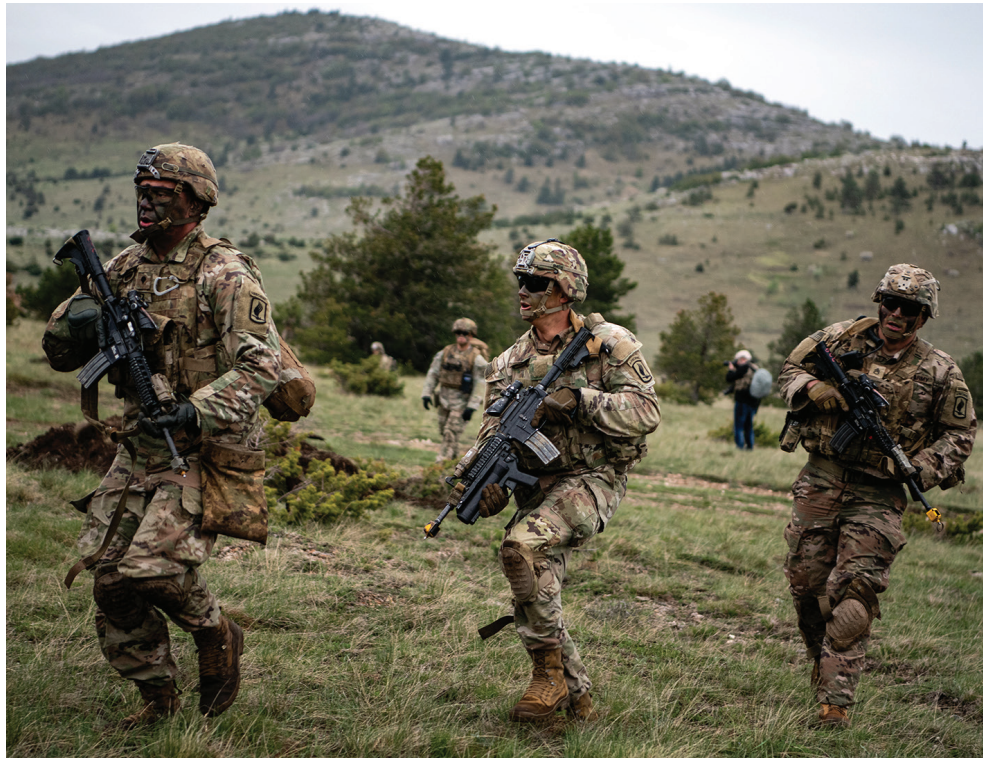
Soldiers assigned to the 1st Battalion, 503rd Parachute Infantry Regiment, move toward a breach point during a platoon exercise. The training was part of Exercise Eagle Rapid 22 at the Crvena Zemlja Training Area near Knin, Croatia.