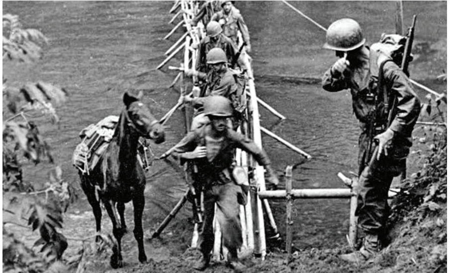
Soldiers with Merrill's Marauders cross the Tanai River on a bamboo bridge near the village of Ning Awng on March 18, 1944.