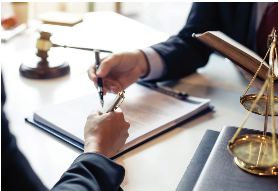
AUSA has paid for a legal document service for all members to provide access to cutting-edge legal technology used by many law firms.

Having them drafted by an attorney can set you back hundreds or even thousands of dollars. We have a better way.