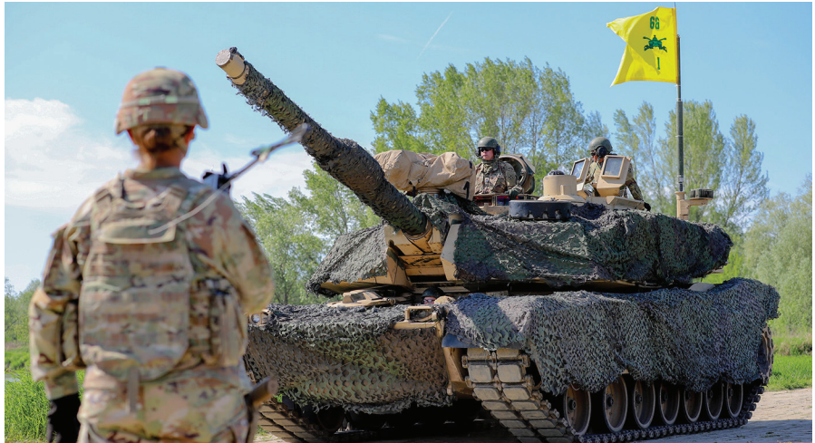
An M1A2 Abrams tank with the 4th Infantry Division moves toward a river crossing during Exercise Defender Europe 22 at Dęblin, Poland, May 12.

Cavoli, commander of U.S. Army Europe and Africa, appeared before the Senate committee May 26 as the