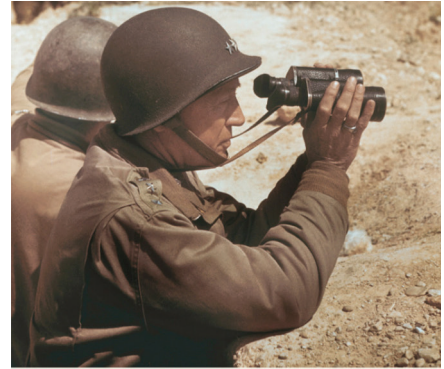
THE BATTLE OF EL GUETTAR AND GENERAL PATTON'S RISE TO GLORY