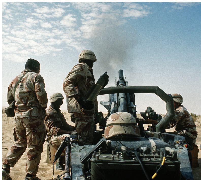
Soldiers with the 1st Battalion, 325th Airborne Infantry Regiment, prepare to fire an M102 towed howitzer during a heavy artillery barrage demonstration for Saudi Arabian troops during Operation Desert Shield.