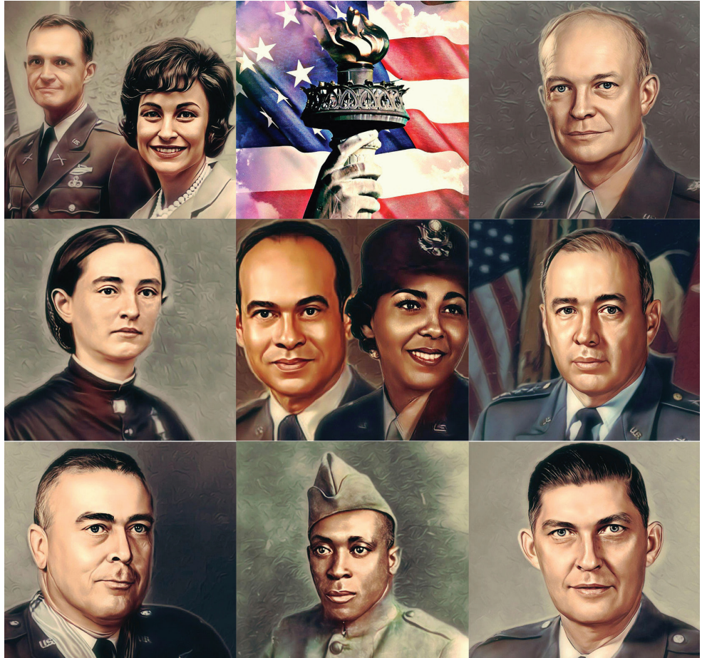
Top row, left to right: Lt. Gen. Hal Moore and Julia Moore, liberty and General of the Army Dwight Eisenhower. Middle row, left to right: Dr. Mary Walker, Lt. Gen. Arthur Gregg and Lt. Col. Charity Adams, and Gen. Richard Cavazos. Bottom row, left to right; Chief Warrant Officer 4 Michael Novosel, Sgt. William Henry Johnson and Tech. Sgt. Van Barfoot.