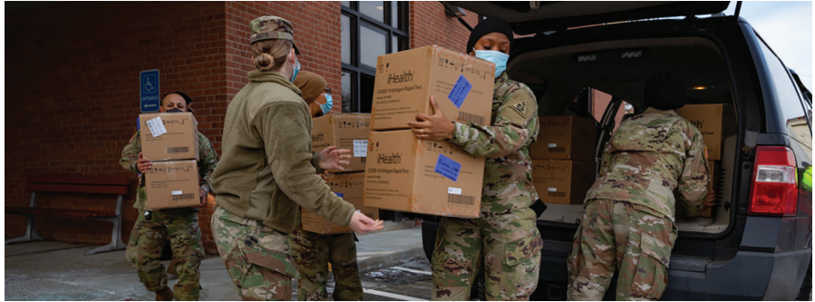
Soldiers with the Connecticut Army National Guard load COVID-19 relief supplies into a truck in North Haven, Connecticut.

The report found the pandemic impacted soldiers' finances and food security. One in seven active-duty families "transitioned from being food secure before the COVID-19 pandem-