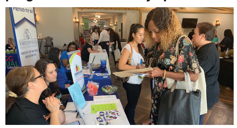
Military spouses network with prospective employers during a spouse career expo at Fort Bragg, North Carolina.

signed on to partner with the Defense Department to recruit, hire, promote and retain military spouses, the Pentagon announced.