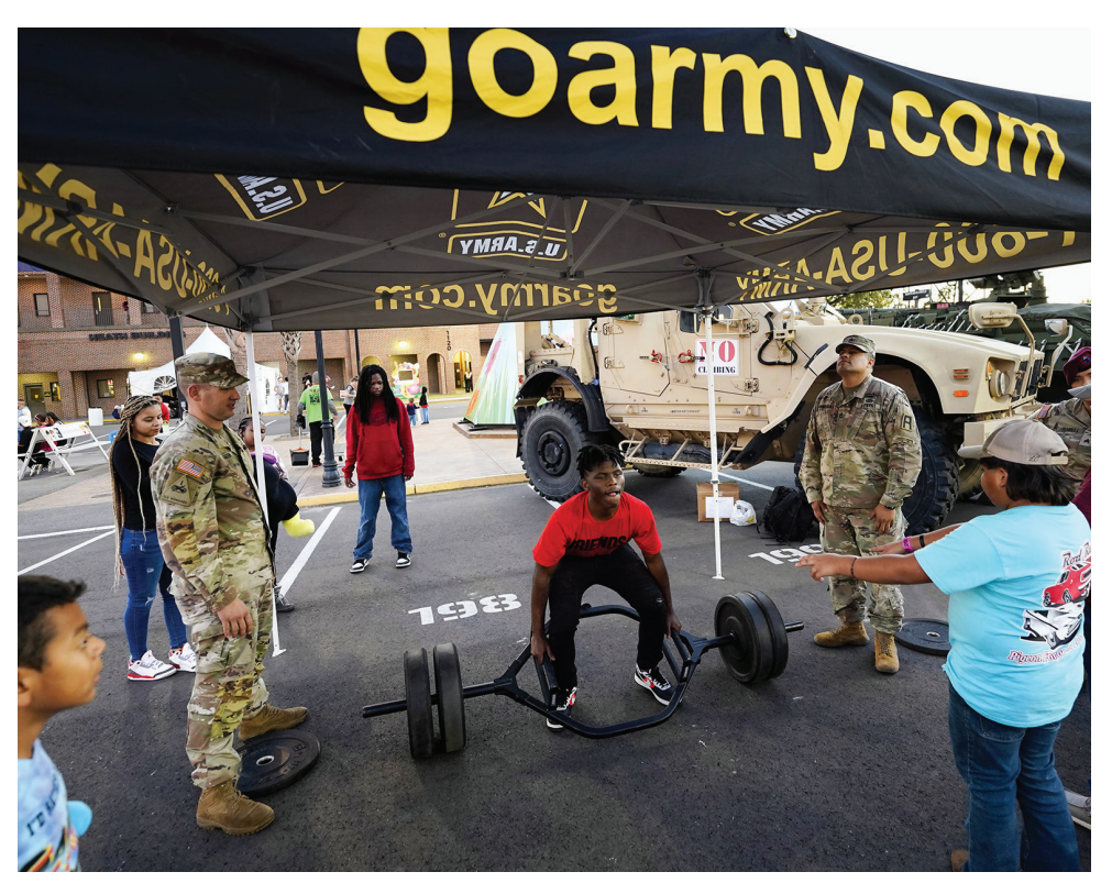
Potential Army recruits test their strength and learn about Army life at the South Carolina State Fair Oct. 21.