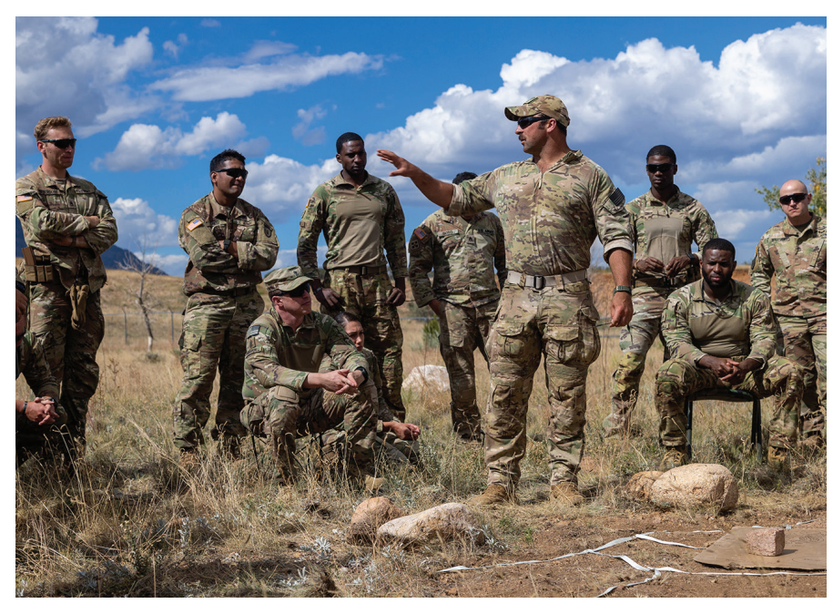
A 10th Special Forces Group operator, center, demonstrates the importance of terrain models to soldiers assigned to the 1st Battalion, 4th Security Force Assistance Brigade at Fort Carson, Colorado.

Though the SFABs, first stood up in 2017, are the first purpose-built formations for security force assistance, the Army has conducted such missions for decades with Special