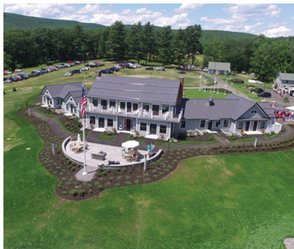
The Travis Mills Foundation lakeside retreat in Mount Vernon, Maine, houses wounded veterans and their families as they recuperate.

For more information about the Travis Mills Foundation or to learn about how to get involved, please visit https://travismillsfoundation.org/