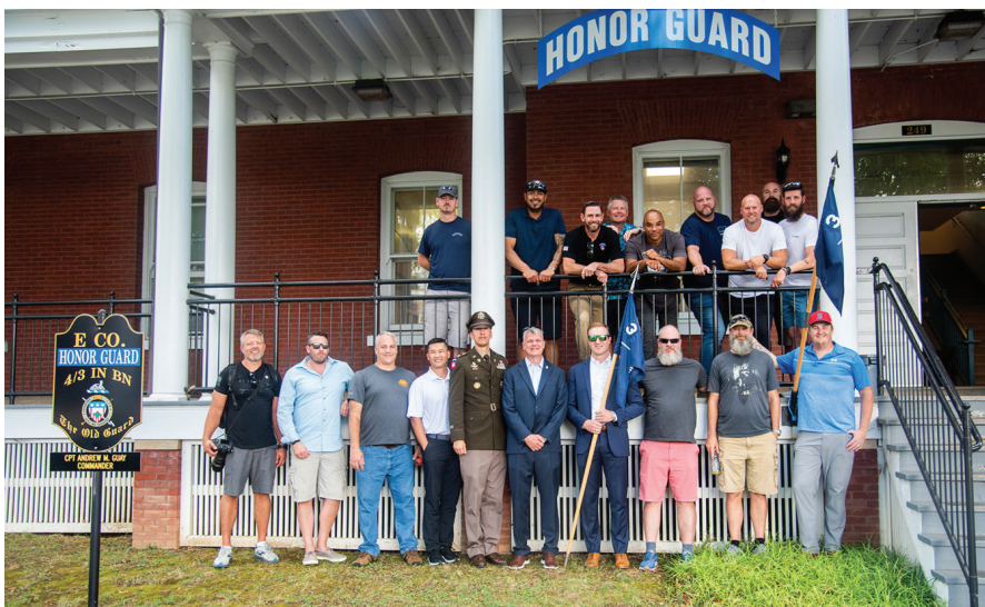
Former soldiers from the Honor Guard Company of the 3rd U.S. Infantry Regiment (The Old Guard) who responded to the Pentagon after the terrorist attacks of Sept. 11, 2001, reunite 22 years later at their old company barracks.

With the precision and discipline that are hallmarks of the Old Guard, the soldiers also helped remove the fallen so they could be identified and laid to rest with honor.