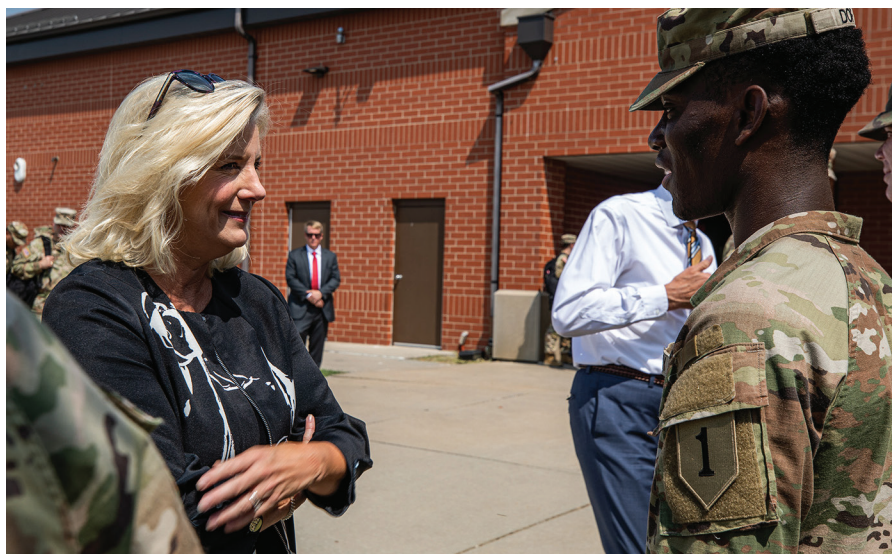
Army Secretary Christine Wormuth, left, speaks with a soldier assigned to the 1st Infantry Division during an Aug. 30 visit to Fort Riley, Kansas.

T he Association of the U.S. Army is joining the Center for Strategic and International Studies in presenting a discussion with Army Secretary Christine Wormuth and Army Vice Chief of Staff Gen. Randy George.