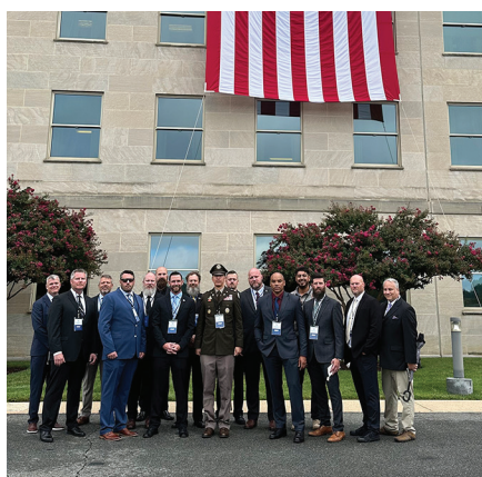
Left: Soldiers who responded to the Pentagon after the 9/11 terrorist attacks gather Monday outside the building at the point of impact of American Airlines Flight 77.