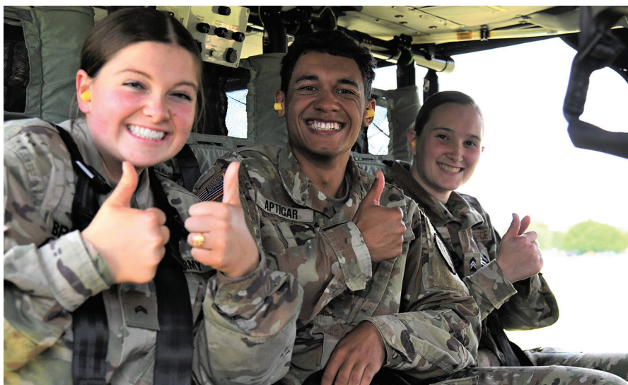
Auburn University ROTC cadets strap in for an orientation flight in a Black Hawk helicopter during a visit to Fort Rucker—now Fort Novosel—in Alabama.