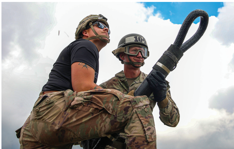
Soldiers with the 10th Combat Aviation Brigade provide air support to the 10th Mountain Light Fighters School during air assault training at Fort Drum, New York, Aug. 11.