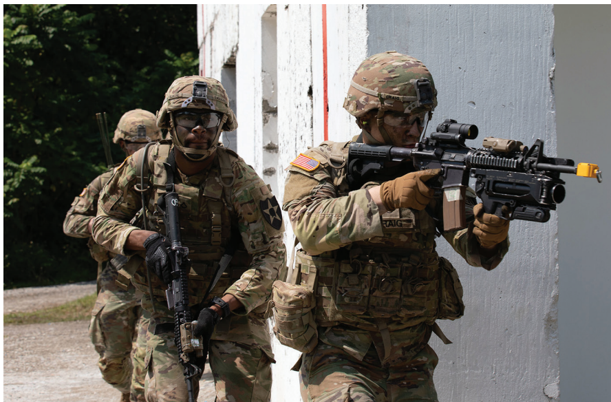
Soldiers with the 1-2 Stryker Brigade Combat Team maneuver around the wall of a building during Exercise Tiger Balm 2022 in Singapore.