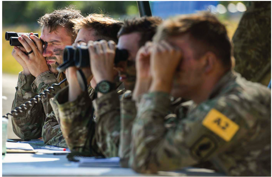
AUSA's National Awards provide recognition for support and dedication to the Total Army and its soldiers. (U.S. ARMY/2ND LT. TIMOTHY YAO)

versity who commissioned in 1987, Faris distinguished herself during the COVID-19 pandemic when, as the interim G-3/5/7 for Army Medical Command, she was asked to lead the daily operations, plans and training for the command and the Army surgeon general's office.