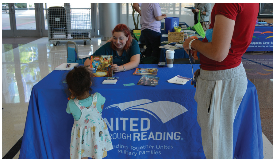
A soldier’s daughter speaks to a United Through Reading representative during an event at Fort Hood, Texas.