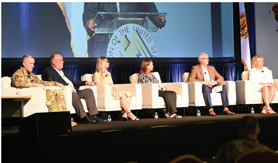
Army leaders, spouses and community leaders speak on a panel on family readiness at AUSA’s Warfighter Summit and Exposition in Fayetteville, North Carolina.

These experts highlighted the importance of working together to