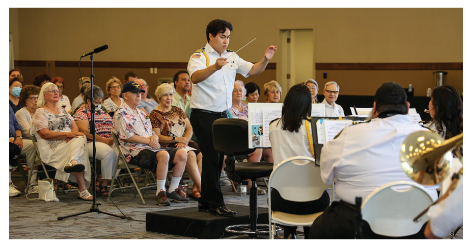
The Sounds of Freedom Band performs for members of the local community at Clovis Veterans Memorial District in Clovis, California.

The Sounds of Freedom Band was formed in 1984 by a group of veterans from the American Legion Post 509 in