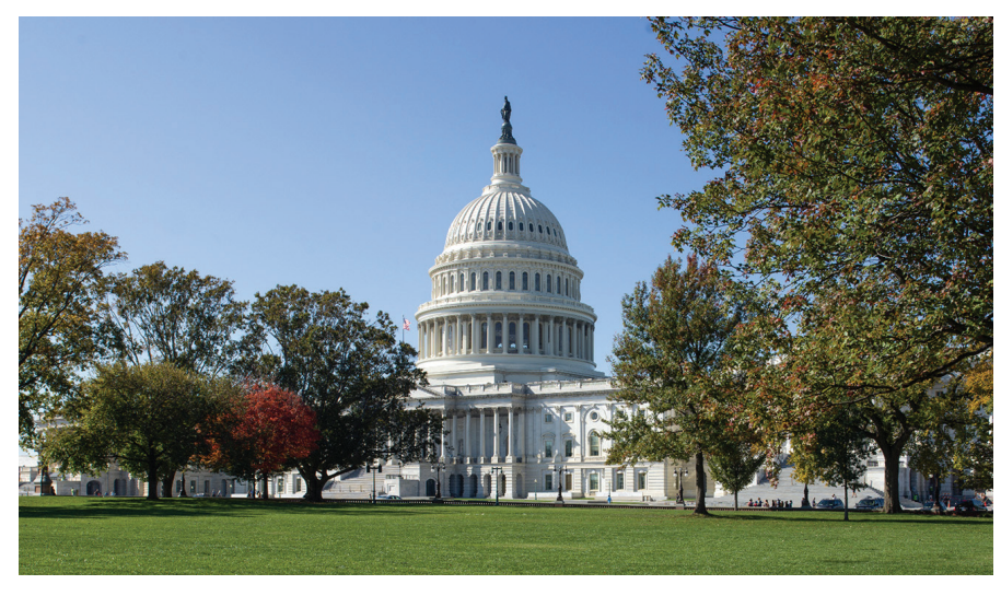
AUSA's top recommendation for Congress is to pass funding legislation in time for the new fiscal year, which begins Oct. 1.

The Senate Armed Services Committee passed its version of the NDAA in June, and it awaits consideration by the full Senate. The timing of when the Senate will take up