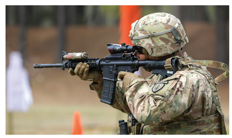
A soldier assigned to the 2nd Security Force Assistance Brigade conducts marksmanship drills at Fort Bragg, North Carolina.