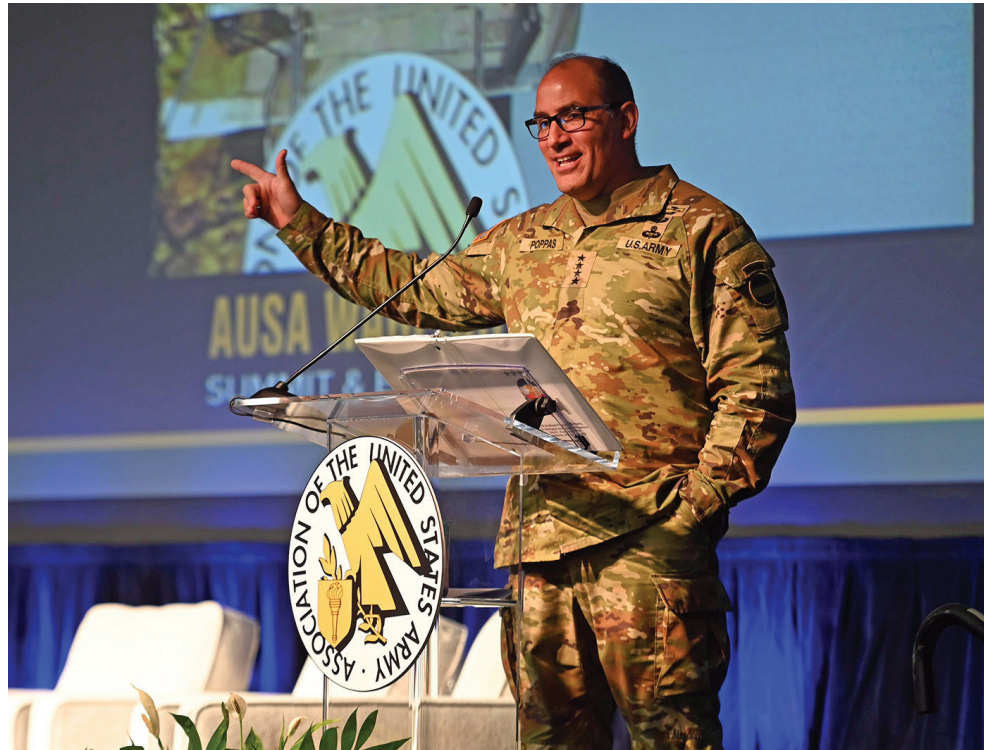
Gen. Andrew Poppas, commander of Army Forces Command, speaks Wednesday at AUSA's inaugural Warfighter Summit and Exposition in Fayetteville, North Carolina.