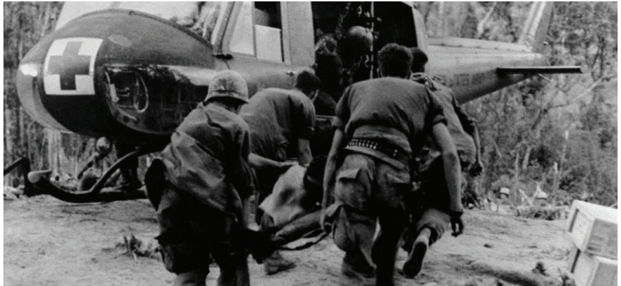
Combat medics load wounded soldiers onto a UH-1 Huey in Vietnam.

The House bill, sponsored by Rep. Derek Kilmer of Washington, has 14 cosponsors, far short of the 218 needed to guarantee passage. The Sen-