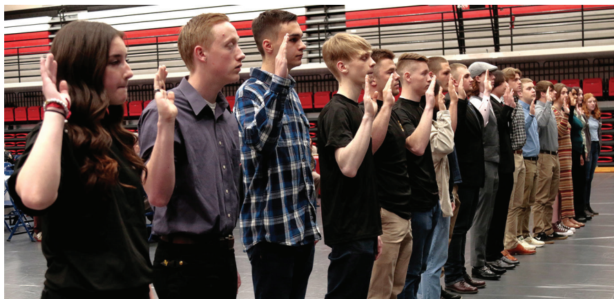
Eighteen high school military recruits recite their oath of enlistment at Saint Martin University in Lacey, Washington, in May.

A rmy leaders have declared war after acknowledging serious problems manning the force.