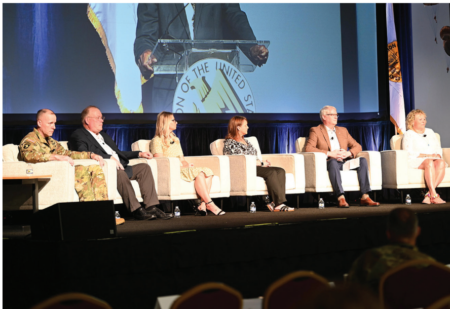
Army leaders, spouses and community leaders speak on a panel on family readiness at AUSA's Warfighter Summit and Exposition in Fayetteville, North Carolina.

From improving permanent change-of-station moves to providing safe housing and high-quality, accessible child care, the Army continues to work to make sure soldiers