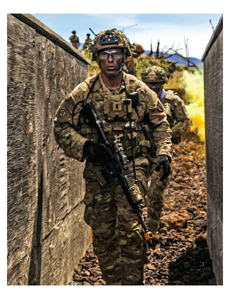
Soldiers assigned to the 25th Infantry Division participate in a live-fire exercise in June at Pohakuloa Training Area, Hawaii.