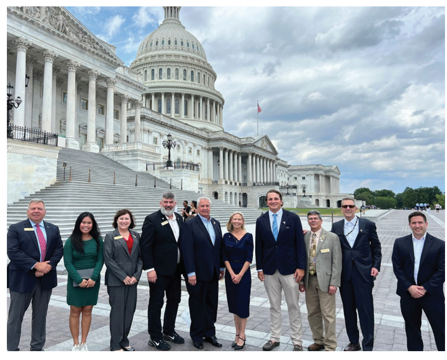
AUSA region presidents and members of the association's national staff visit Capitol Hill to advocate on behalf of soldiers and families.

The Army's "People First" priorities, including improving housing for soldiers and families and supporting other quality-of-life initiatives, were prominent topics of discussion. The importance of ensuring that the Army's recruiting efforts are successful, providing the best possible care for veterans and providing support