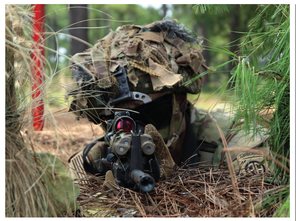
A paratrooper with the 82nd Airborne Division demonstrates defensive positions June 29 during a professional development event at Fort Liberty, North Carolina.