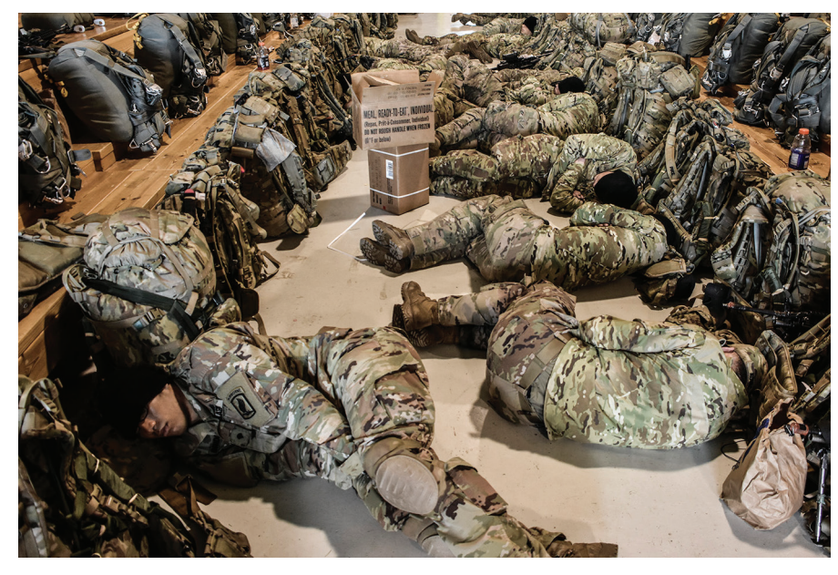
Soldiers with the 173rd Airborne Brigade catch a few hours of sleep before a combat airborne training operation in Hohenfels, Germany.

points, from 9% in 2020 to 14% in 2021. "High-quality sleep is critical to Soldier readiness and mission success," the report found. "Quality sleep can help increase productivity and decrease the risk of accidents, errors and injuries."