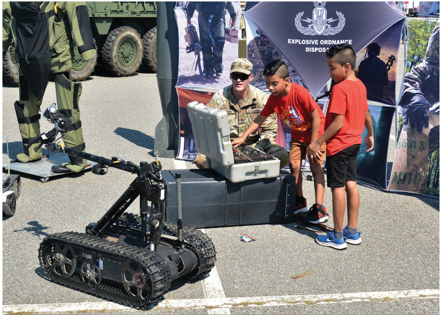
Community members try their hand at operating explosive ordnance disposal robots during a Meet Your Army event at Fort Gregg-Adams, Virginia.

“Our recruiters, particularly on the Army side, have really been able to adjust to the current environment,