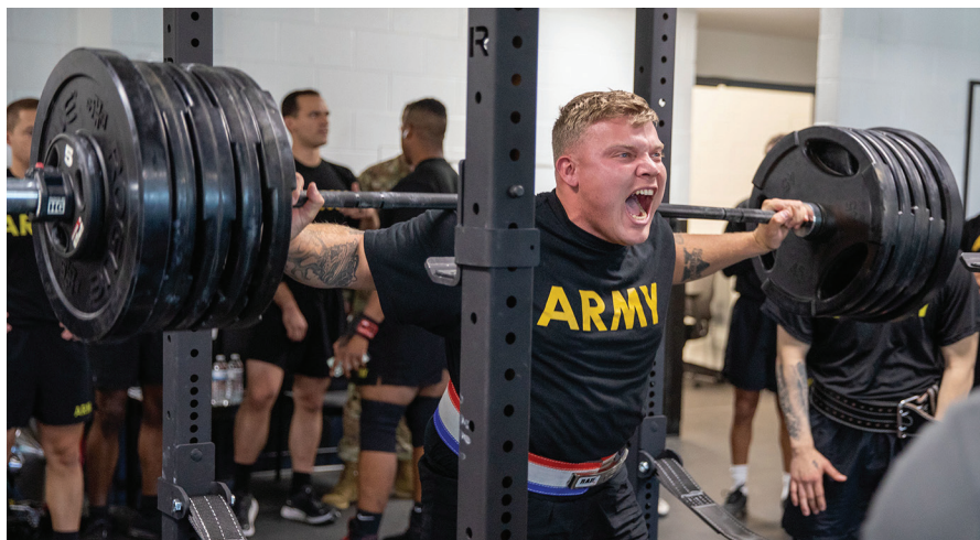
A 10th Mountain Division soldier participates in a weightlifting competition hosted by the division's Holistic Health and Fitness team at Fort Drum, New York.

F aced with changing adversaries and an increasingly complex operating environment, the Army must make sure soldiers are ready to fight, win and not just survive, but thrive, a senior Army leader said.