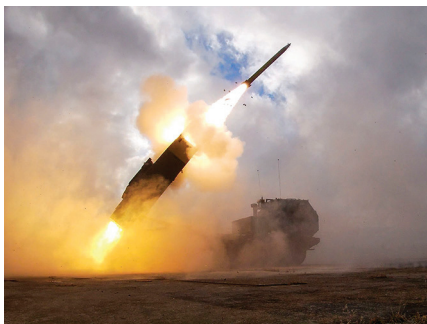
A High Mobility Artillery Rocket System attached to the 41st Field Artillery Brigade fires a rocket at Vidsel Test Range, Sweden.