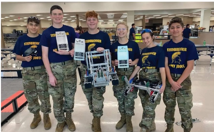
Junior ROTC cadets from George M. Steinbrenner High School were named national champions at the 2023 VEX Robotics World Championship.