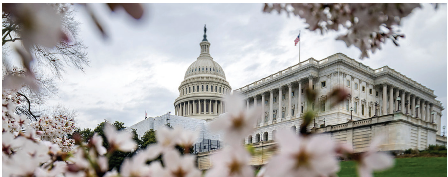
AUSA is urging Congress to complete defense legislation by the Oct. 1 start of the fiscal year and approve additional Army funding.