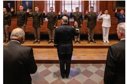
Joint Chiefs Chairman Gen. Mark Milley administers the oath of office to Princeton University's 14 newly commissioned officers.

ley said. "It's on your watch over the next 10 to 20 years," he told the cadets. "The United States military is either going to adapt and be dominant in the world of military operations, and therefore deter war, or not. If it's not [effective], then a lot of things are going to be at risk, things that we don't even want to think about."