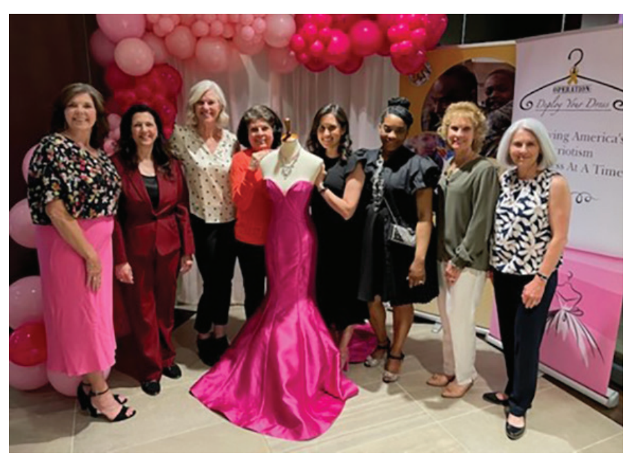
Leaders and volunteers from AUSA, Operation Deploy Your Dress, DoD and other organizations gather for the sixth annual pop-up dress giveaway for service members and dependents at AUSA headquarters in Arlington, Virginia.

The dress giveaway continued May 8, when AUSA and Operation Deploy