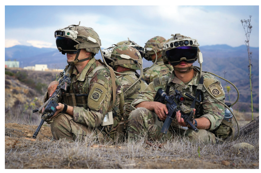
Soldiers with the 82nd Airborne Division train with the Integrated Visual Augmentation System during Project Convergence 22 at Camp Talega, California.

From drone resupply to exoskeletons, the Army is looking at how it can make soldiers more lethal and