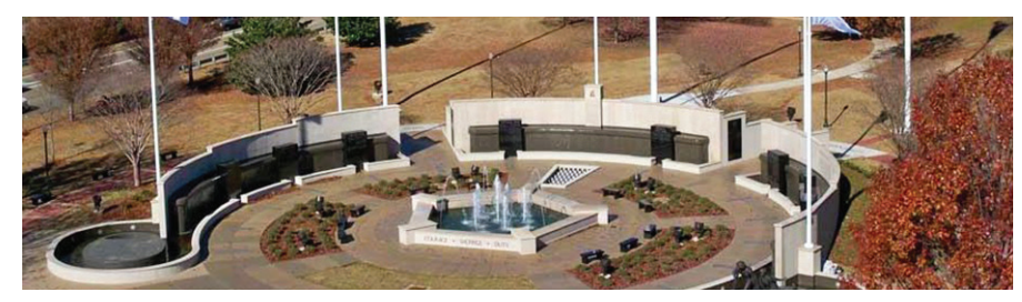
The Huntsville Madison County Veterans Memorial.

Veterans Memorial was dedicated on Veterans Day in 2011. It exists to honor those who have answered the call of duty by serving in the armed forces.