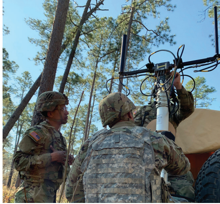
Soldiers with the 3rd Infantry Division test an antenna for a network equipment set during the Army's three-week armored formation network pilot at Fort Stewart, Georgia.

mand and Control, DoD's concept to connect sensors from all the military services into a single network, according to the Congressional Research Service.