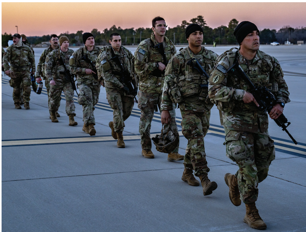
Paratroopers assigned to the 82nd Airborne Division walk to their aircraft Feb. 14 at Pope Army Airfield, North Carolina. The soldiers are deploying to support U.S. allies and partners in Eastern Europe.