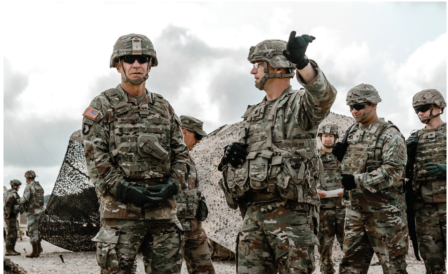
Army Chief of Staff Gen. James McConville, left, speaks with soldiers from the 278th Armored Cavalry Regiment during training at Fort Hood, Texas.

McConville pledged that he and Army Secretary Christine Wormuth remain “committed to modernizing